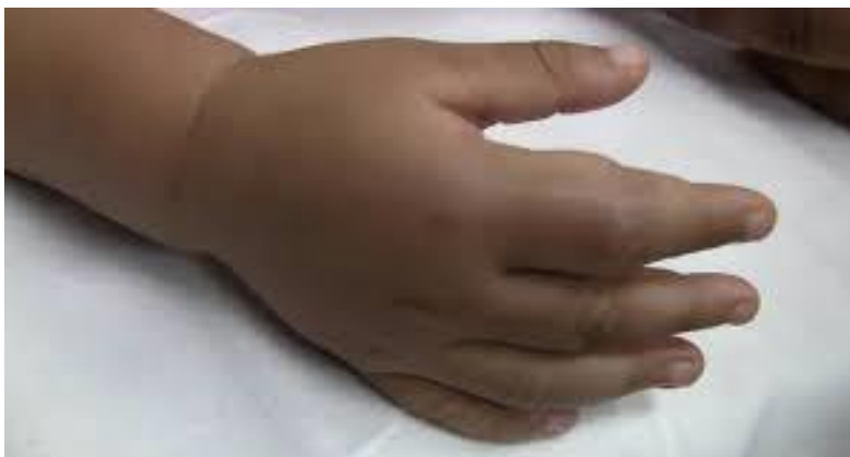
Figure 1: Dactylitis in Sickle cell disease

Dactylitis, often referred to as hand-foot syndrome, is often the first manifestation of pain in children with sickle cell anemia, occurring in 50% of children at the age of 2 years. Dactylitis often manifests with symmetric or unilateral swelling of the hands and/or feet. Unilateral dactylitis can be confused with osteomyelitis, and careful assessment to differentiate between the two is important, because treatment differs significantly. Dactylitis requires palliation with pain medications, such acetaminophen with codeine, whereas osteomyelitis requires at least 4-6 weeks of IV antibiotics.