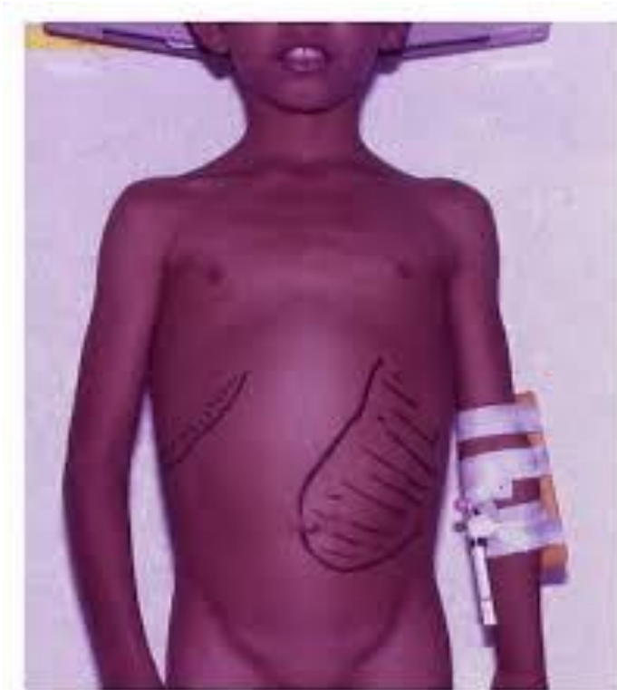
Figure 2: Splenic sequestration in Sickle cell disease