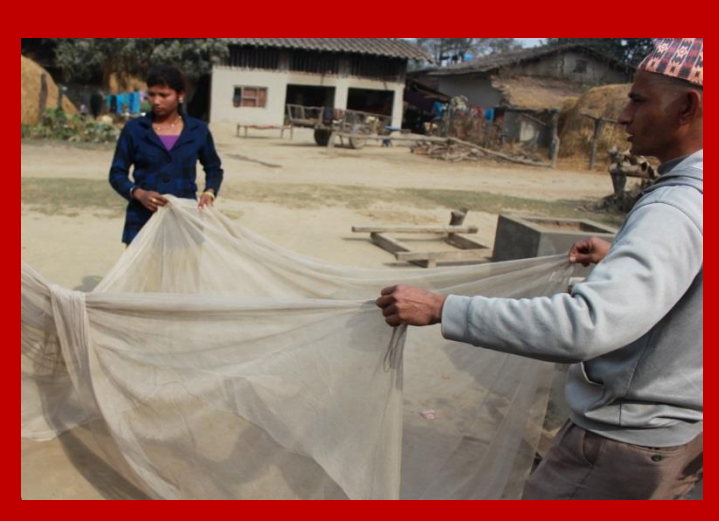
Local showing the condition of LLIN during the visit at Kanchanpur distict.