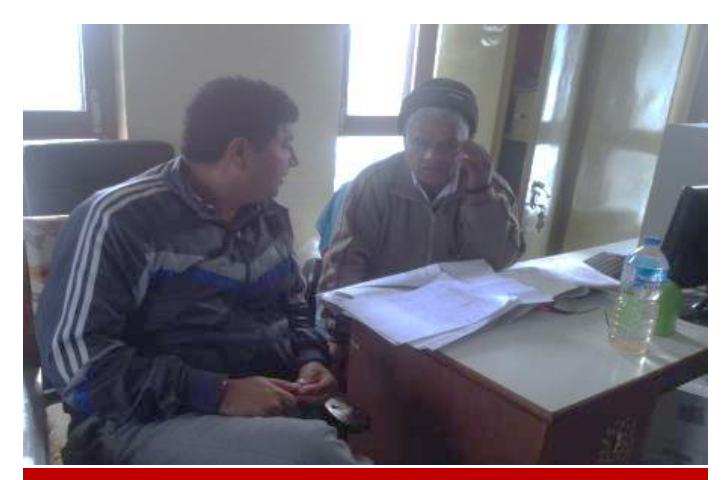
Providing orientation to VCI at Sindhuli district about possible areas of errors while recording data.

EDCD based malaria team visited 18 program districts (Ilam, Jhapa, Morang, Sunsari, Bara, Parsa, Chitwan, Makawanpur, Sindhuli, Nawalparasi, Kapilvastu, Rupandehi, Banke, Bardiya, Surkhet, Kailali, Kanchanpur and Dadeldhura) for data cleaning, supervision of the data from health facilities and logistic status at DPHOs/DHOs in this period. The data that have been received through the HMIS has been found to have several discrepancies which needed to be cleaned. The team provided orientation to malaria focal person (VCO/VCI/MI/Statistic Officer) at district to encourage and motivate for correct, complete and timely recording and reporting. Logistic status on antimalarial drugs, LLIN and stock out at DHO/DPHO is also observed by the team.