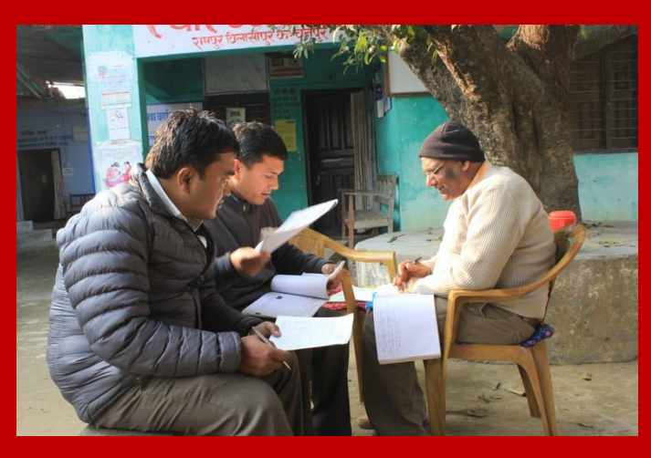
Team collecting information during Micro Stratification at Rampur Bilasipur VDC, Kanchanpur.