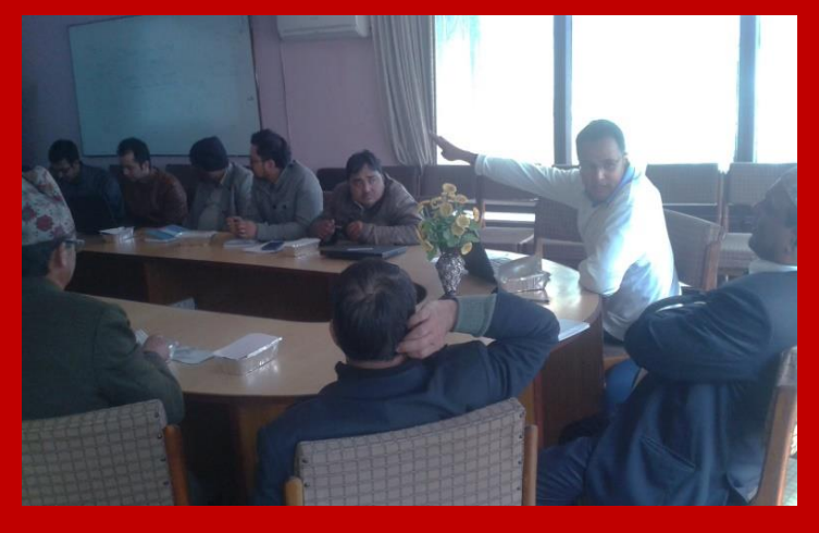
Coordination meeting with Malaria team during the finalization of activities and budget for the next period.