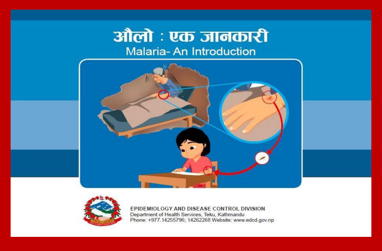
Cover design of Flip Chart which is under the process of printing.