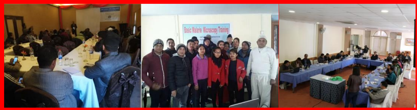
Participants presenting the status of their district on Regional Review Meeting of western region at Pokhara, Kaski.